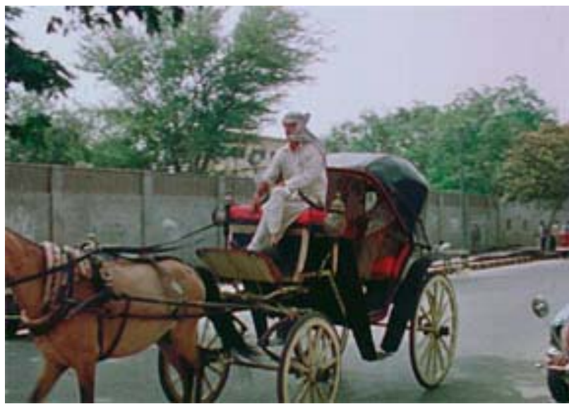
(Ref 3) da Vinci Primary grading with Custom Curves

The objective now is to balance the picture using the usual clues. In our sample frame, the black of the cab and the white of the garments are a good starting point for neutrals. The skin and the