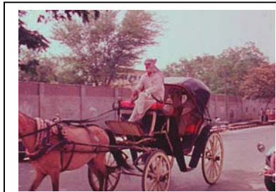
Original Film Frame

The base transformation is now complete, and could be recorded back to film as a permanent restoration, or to tape for distribution. Some corrections go beyond pure archival restoration, though, and if the material is destined for re-release, there is more work to be done.