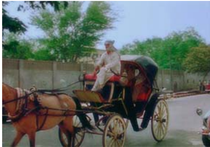
(ref 5) Final Grade

If the material had already been through a restoration process, grain and dirt would probably not be an issue. Otherwise a real-time noise reducer could be used. Unfortunately, these devices apply temporal filtering that can generate unacceptable artifacts.