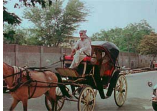
(Ref.2) Telecine Adjusted

demonstrate how quickly true color can be restored to film.