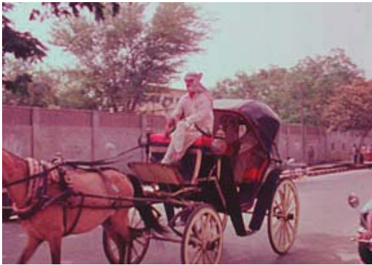
Telecine Base Memory (TAF)

By walking through a color restoration process with our sample frame, it's easy to