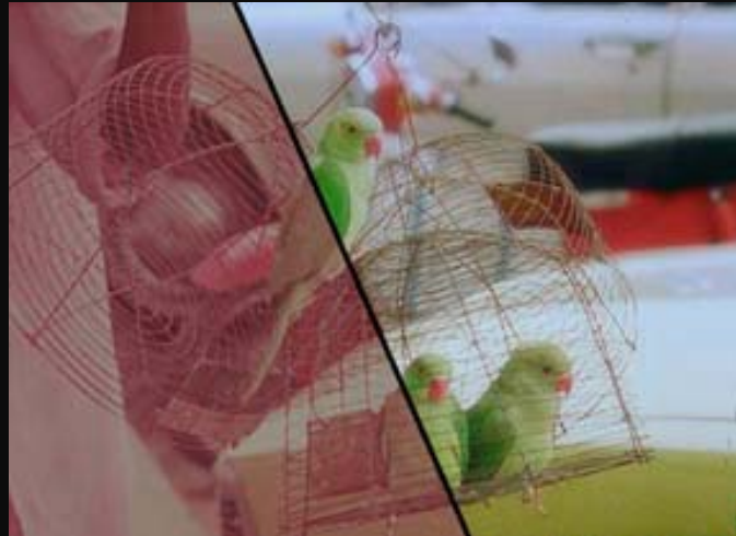
(ref 6) Same One Light Grade Applied to Other Scenes