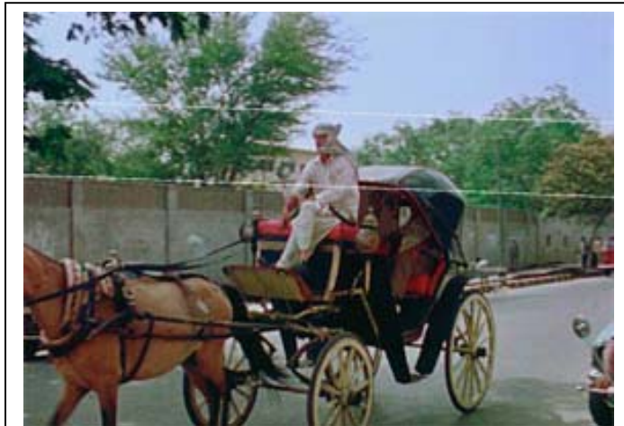
(ref 4) Secondary Enhancements.

The sample image is now probably as faithful to the print image as is possible, given the fading. However, it still lacks the color depth that it likely had when it was first seen fifty years ago. Secondary enhancements can restore some of that former glory.